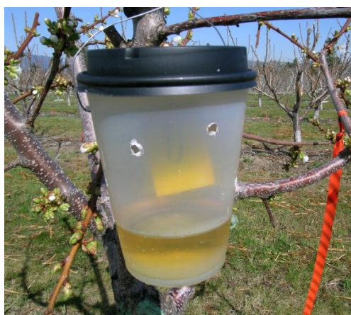
Apple cider vinegar trap

Traps can be made of any 250-750 ml plastic container or cup with a tight fitting lid. Drill 4-5 holes (use a 3/16 - 3/8 inch drill) on one side of the container to allow flies to enter (holes shouldn't be too big or other large insects can get in). Containers that already have holes, like commercial vinegar/fruit fly traps will work. Place holes on the side of the container to keep out rain.