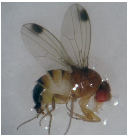
Spotted wing drosophila adult male has one dark spot on each wing.

Female egg laying leads to scarring of fruit, fruits get contaminated with larvae, become soft and the fruit wall collapses. There may be secondary infection of mold and bacteria at egg laying site.