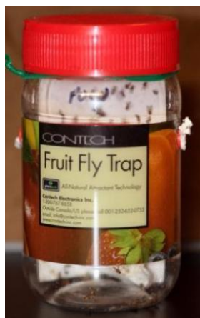
Contech fruit fly trap.