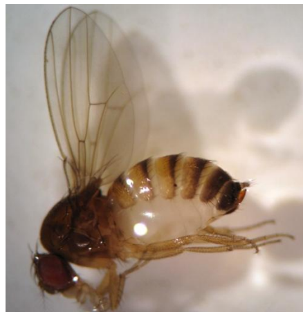
Spotted wing drosophila female does not have spots and is similar to many other species of vinegar flies. Photo Credit: Sheila Fitzpatrick, Agriculture & Agri-Food Canada

Photo Credit: Sheila Fitzpatrick, Agriculture & Agri-Food Canada