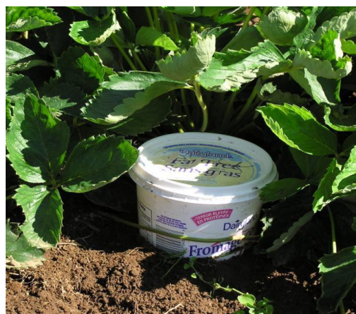
Trap in a strawberry field