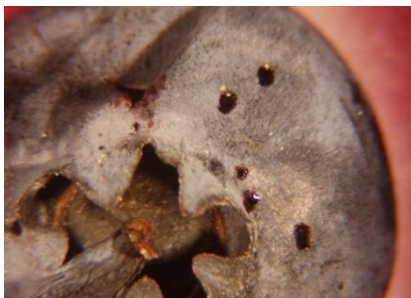
Spotted wing drosophila oviposition holes in blueberry