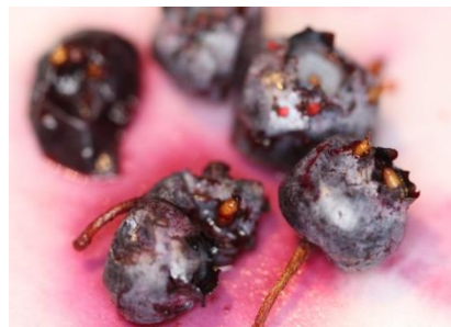
Spotted wing drosophila-infested blueberry fruit with pupae