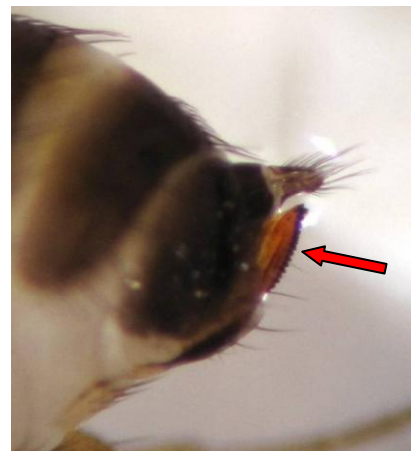
Adult female has a saw-like ovipositor that distinguishes it from other vinegar flies.